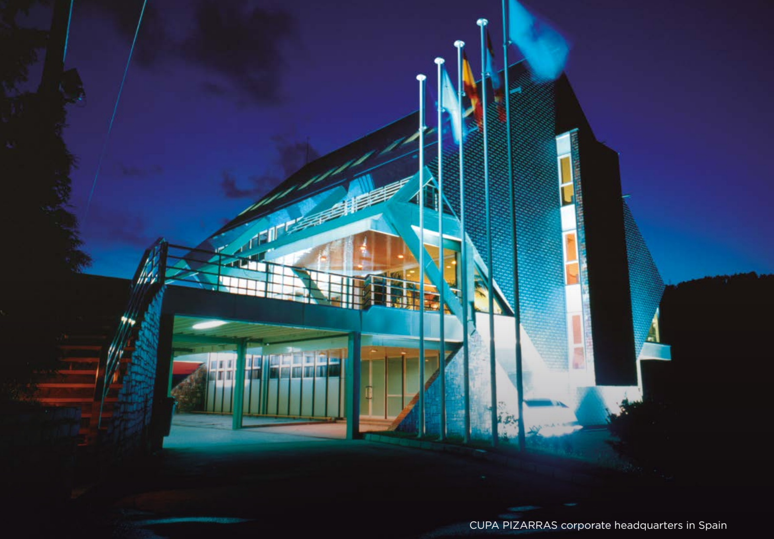
CUPA PIZARRAS corporate headquarters in Spain

CUPA PIZARRAS is the world leader in the sale and manufacture of natural slate. The Group has its origins in a company called Cupire Padesa which was founded in 1892.