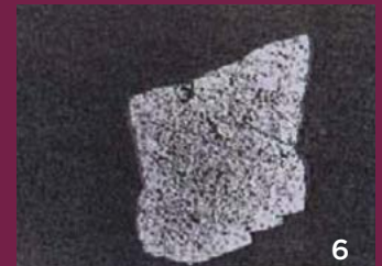
Fig 1. Plane Polarised Light